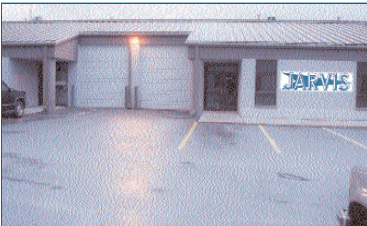
Front view of Jarvis' new 20,000 square foot warehouse in Omaha, Nebraska.

Since October 2000, Jarvis Products has been renting a new 20,000 square foot warehouse facility in Omaha, Nebraska. Additional warehouse space was needed to quickly fulfill the service requests of Jarvis' American Mid-West customers.