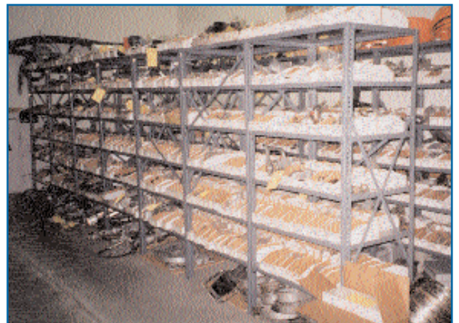
As shown in the above photograph, the new warehouse has ample storage space to serve Jarvis' Mid-Western customers.